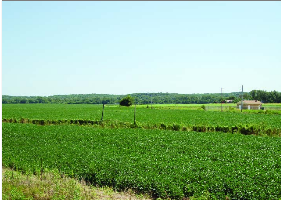
This part of the Kansas River Valley was proposed to be the location of a Lafarge North America Inc. sand and gravel extraction project. The well house for Leavenworth RWD 7 can be seen at the right of this photo.

Because these stream channel alluvial aquifers have well sorted material, are easily recharged by precipitation and stream flow, and generally store good quality water, they are excellent sources of water for irrigators, industries and public water systems. A count of the number of wells in the Kansas Department of Agriculture - Division of Water Resources database finds that there are at least 3,300 water wells tapping an alluvial aquifer in Kansas.