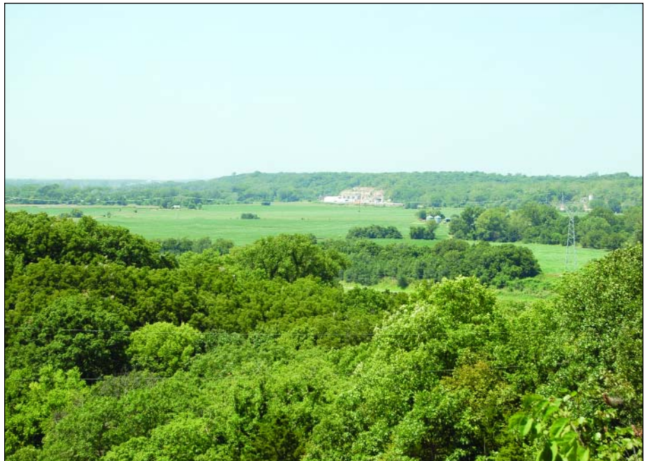
Looking west from Johnson County over the Kansas River which is hidden by the trees, one can see the location originally proposed to be the site of a sand pit which was be approximately 180 acres in size after the project was completed.