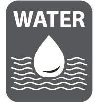
W-6 Total Coliform and E. coli Bacteria

Store unopened Petrifilm plate pouches at temperatures below 46° F. Allow pouches to come to room temperature before opening. Return unused plates to the pouch. Prevent exposure to moisture after opening pouches. Store resealed pouches in a cool dry place for no longer than one month. Exposure of plates to temperatures above 77° F and/or humidities above 50 percent can affect performance of the plates. Do not use plates that show orange or brown discoloration. Expiration date and lot number are noted on each package of Petrifilm plates. After use, Petrifilm EC plates will contain viable bacteria. Put all used Petrifilm in a plastic bag, inside another plastic bag, and take to sanitary landfill or transfer station. Alternatively, mix a mild chlorine bleach solution (10 percent) and put one dropper full on each exposed plate to kill the bacteria before disposal.