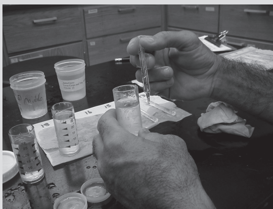
Figure 5-4. Use the bubble to mix the sample. Then read the blue color indicator.

use. We recommend the CHEMets kit because it is accurate, easy to use, and reasonably priced. Directions in this fact sheet are specific for this kit. Results are presented as \text{PO}_4 , similar to an agricultural soil test, rather than \text{PO}_4\text{-P} , more common for water samples. Store the kit at room