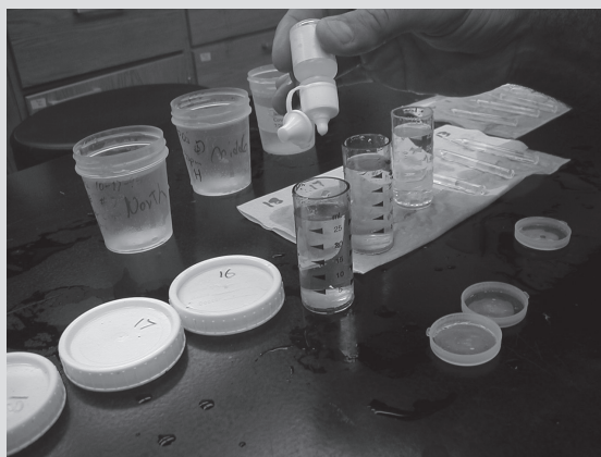
Figure 5-2. Add 25 ml of water to sample vial, then add two drops of activator solution.

We compared several phosphorus test kits to commercial lab results. Some test kits are not accurate, and others are too complex for field